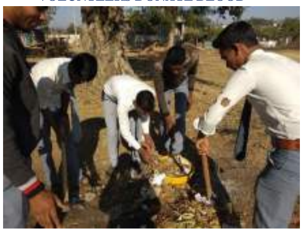
SHRAMDAN IN VILLAGE DHAKNI