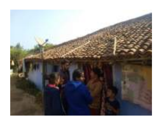
Survey by NSS volunteers