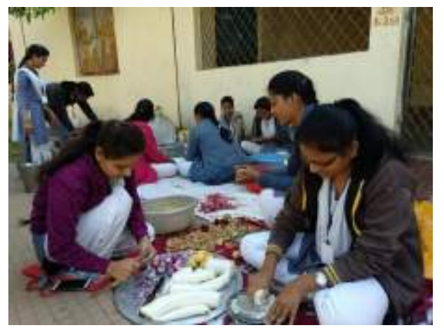
LUNCH PREPARATION BY VOLUNTEERS