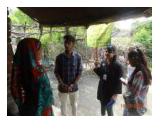
Survey on Open defecation

At Adopted village Gram Dhakni, NSS unit had conducted door to door visit to aware villagers regarding the harmful effects of open defecation on human health. NSS volunteers had given their message by performing "Path Natya" and create awareness among villagers. About 74 students had actively participated in this activity.