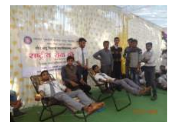
VOLUNTEERS DONATE BLOOD