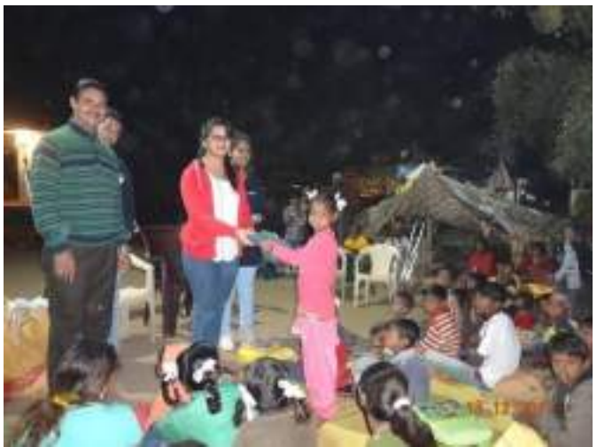
Cloth distribution to Childrens