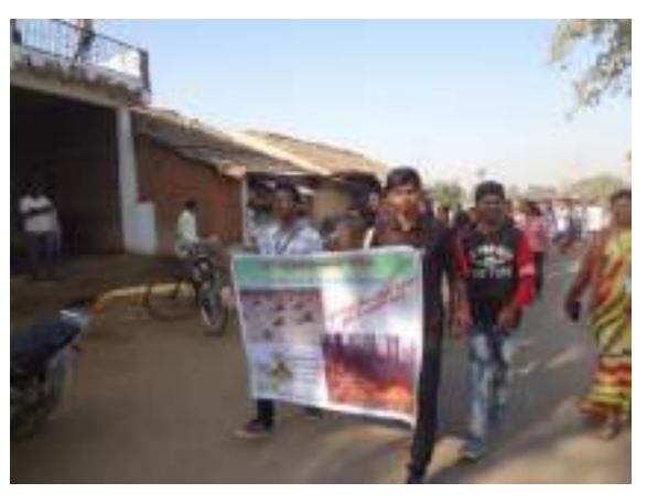
ENVIRONMENTAL AWARENESS RALLY