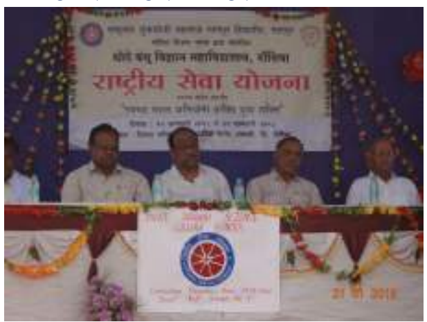
CONCLUDING CEREMONY OF NSS CAMP