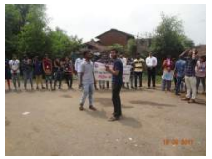
Street play on Open defecation