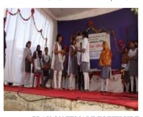
PLAY ON FEMALE FOEITICIDE