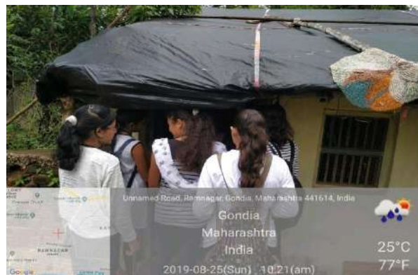
Interaction with Slum People by NSS Volunteers