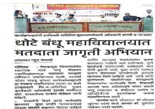
Debate Competition on Voter Awareness