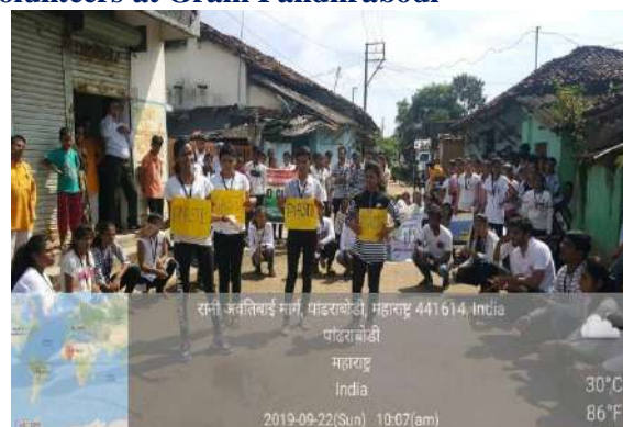
Plastic bag collecting by NSS volunteers Street play on plastic effect