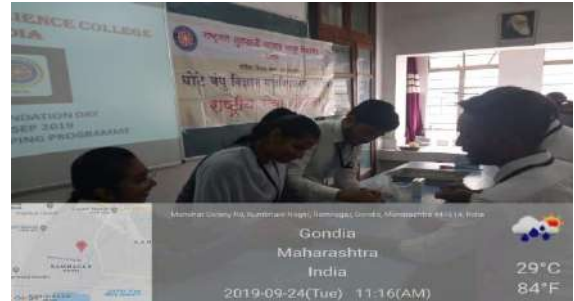
NSS Programme Officer guiding to find the Blood group of the students