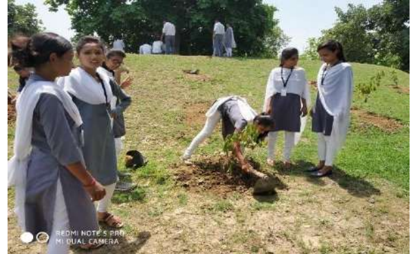
NSS Volunteers during plantation