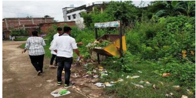
Street play performing by NSS Volunteers Shramdan by NSS Volunteers