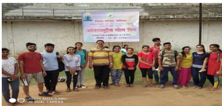
NSS Volunteers gathers on occasion of International Yoga Day