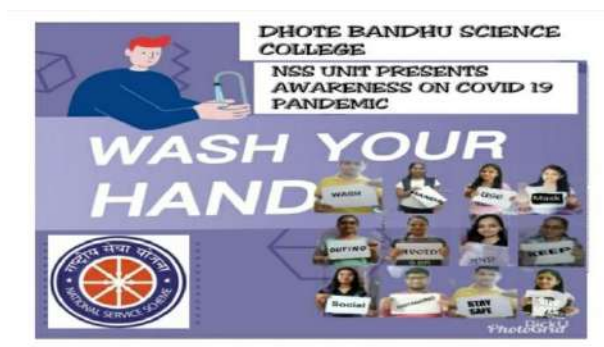
NSS Volunteers making Digital Poster to aware people regarding COVID-19