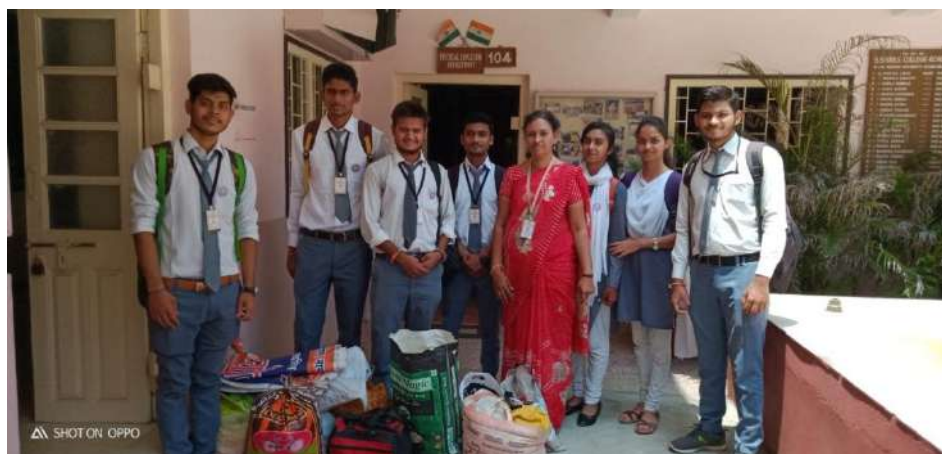
NSS Volunteers donate grain on occasion of Kolhapur Flood