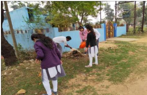
Swachhta Abiyan at Gram Pandhribodi