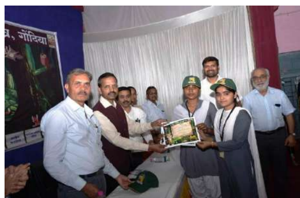
NSS Volunteers in Essay Competition & Slogan Competition