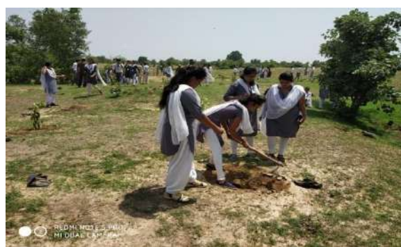
Tree plantation by College Faculties NSS Volunteers during the plantation programme