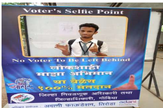
Selfie Competition on Voter Awareness