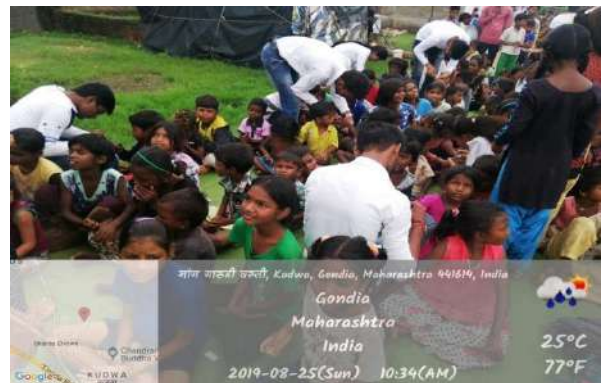
Rally on Health and Hygiene by NSS Volunteers Nails cutting of slum children’s by NSS Volunteers