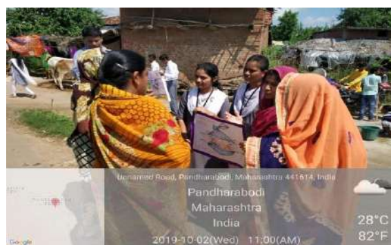
Plastic ban awareness rally by NSS volunteers at Gram Pandhrabodi