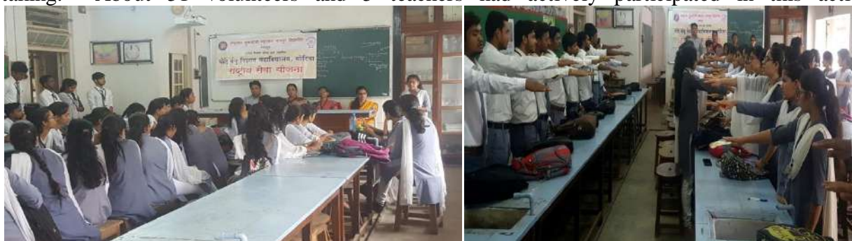
NSS Volunteers Sharing the views on this occasion Pledge taken by NSS Volunteers on occasion of World No Tobacco Day