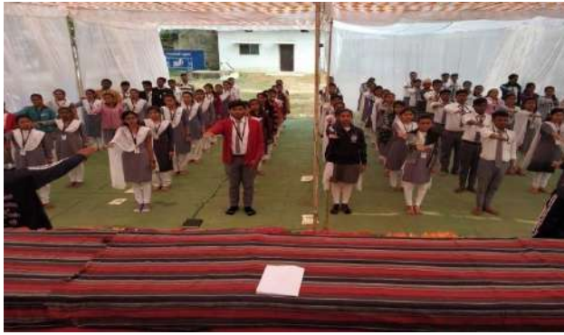
NSS Volunteers taking pledge on this occasion