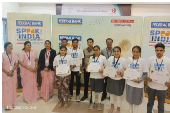
Selected students and team of judges and organizers