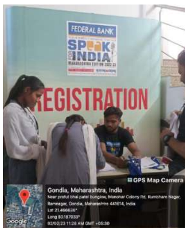
Registration of the students